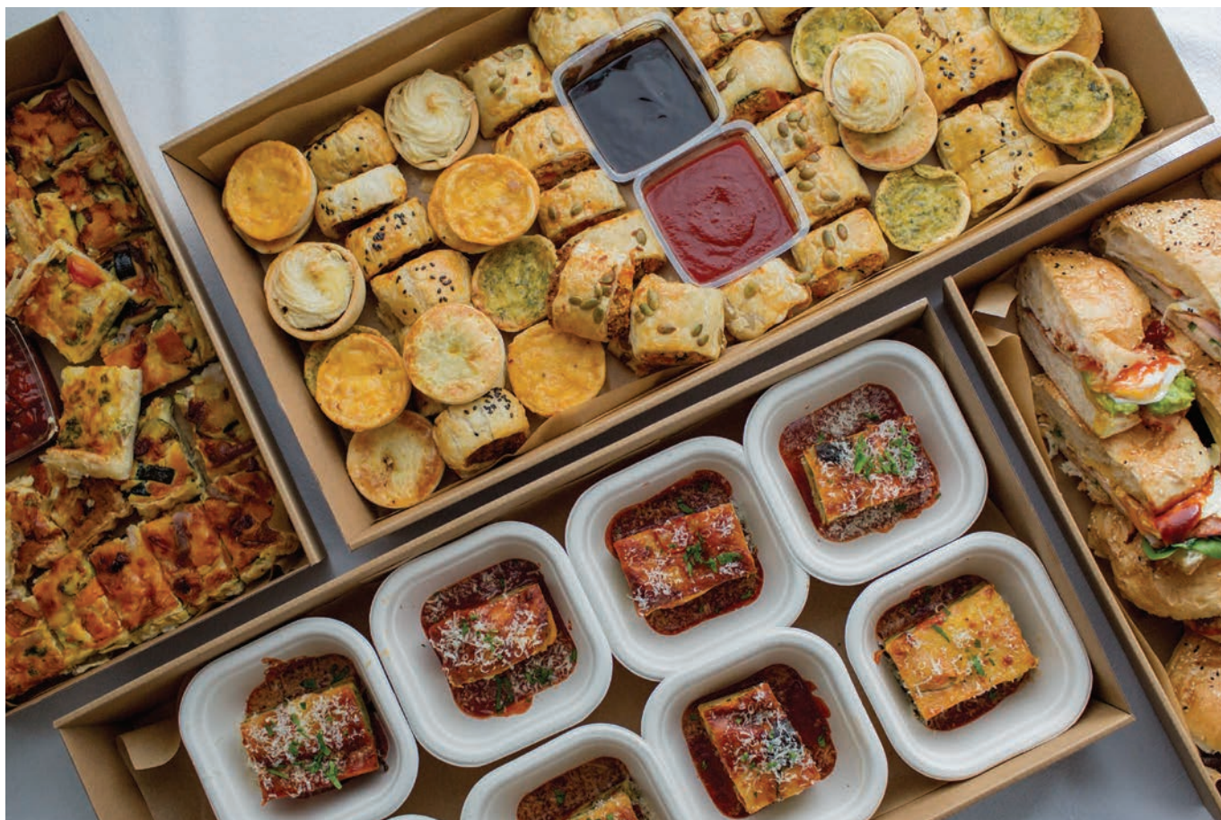
Mixed Selection of Hot Food