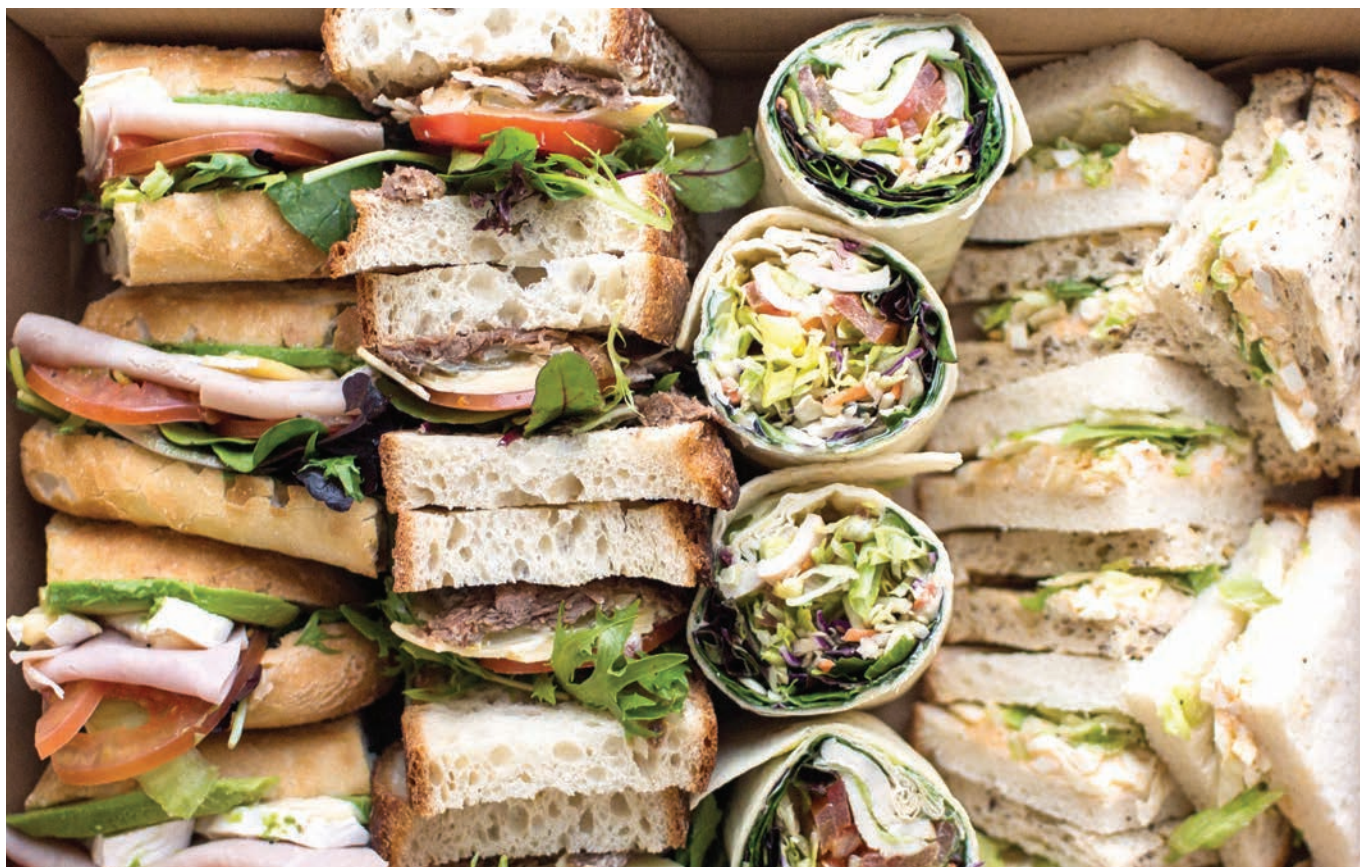
Mixed Sandwich Box